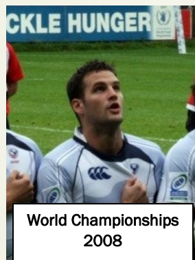
World Championships 2008

the personal responsibility of maintaining a high level of physical fitness, required me to manage time wisely and instilled in me the importance teamwork and personal accountability.