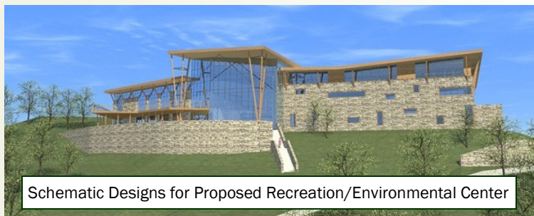
Schematic Designs for Proposed Recreation/Environmental Center

rotated through various departments (Facilities Management, Program Coordination, Registration, Promotion, etc.) in order to recognize and understand the various responsibilities of leaders within the community recreation industry. During my internship, the township was in the process installing a new community-owned 130,000 square foot synthetic turf field (pictured below). The field is part of a planned 45-acre intergenerational active recreation complex which will include an indoor recreation/environmental facility. These developments enhanced my internship experience, and provided a opportunity to learn how industry professionals work collaboratively with local and regional residents, government, and public officials to provide dynamic recreational opportunities.